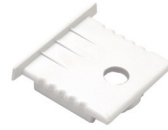
open end cap