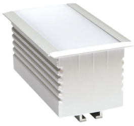
shown with closed end cap